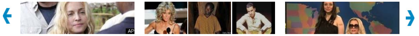
Madonna Jets Out Of Malawi