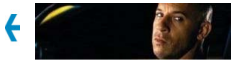
'Fast & Furious' HAUL: Rakes In $72.5M