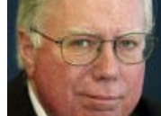
Fox To Help Promote Corsi's Birther Book