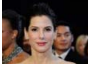
Sandra Bullock Furious Over Ex Jesse James's...