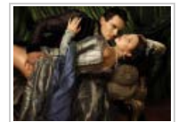
Sex, Scandal And Debauchery Among Historic British