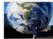
9 Earth Day Favorites You Should Read To