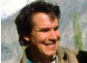
Greg Mortenson Hospitalized: 'Three Cups Of Tea'...