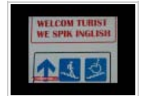
Which Countries Speak The Best English?