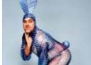
Awkward Family Photos: Easter Edition (PHOTOS)