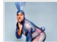
Awkward Family Photos: Easter Bunny Edition