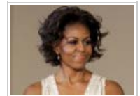
Michelle Obama Wears Naeem Khan To State Dinner