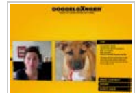
7 Sites You Should Be Wasting Time On Right Now