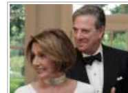
Nancy Pelosi Wears Vintage Thierry Mugler To