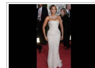
7 Celebrity Fad Diets