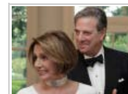
Nancy Pelosi Wears Vintage Thierry Mugler To