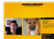
7 Sites You Should Be Wasting Time On Right Now