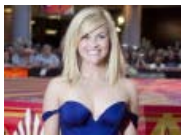
Reese Witherspoon In 'Who Invited Her?': Actress...