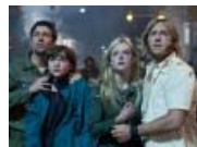
'Super 8' Sneak Screenings Thursday: JJ Abrams...