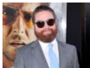
'The Hangover 3': Zach Galifianakis Reveals Mental...