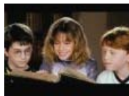
'Harry Potter' First Screen Test: Daniel Radcliffe,...