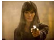
Angelina Jolie's 'Salt' Getting Sequel