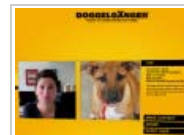
7 Sites You Should Be Wasting Time On Right Now