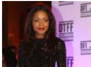
Naomie Harris: New Bond Girl In 'Bond...