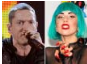
Eminem: 'A Kiss' Calls Lady Gaga 'Male...