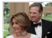
Nancy Pelosi Wears Vintage Thierry Mugler To