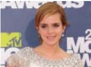
Emma Watson: Guys Are Intimidated By Me,...