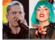
Eminem: 'A Kiss' Calls Lady Gaga 'Male...