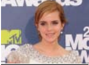
Emma Watson: Guys Are Intimidated By Me,...