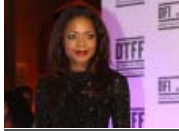
Naomie Harris: New Bond Girl In 'Bond...