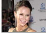
Jennifer Love Hewitt: Worst Actress Since 1985,...