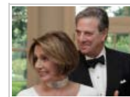
Nancy Pelosi Wears Vintage Thierry Mugler To