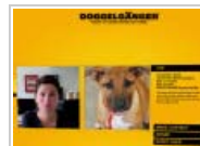
7 Sites You Should Be Wasting Time On Right Now