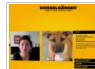
7 Sites You Should Be Wasting Time On Right Now