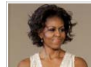
Michelle Obama Wears Naeem Khan To State Dinner