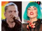
Eminem: 'A Kiss' Calls Lady Gaga 'Male...