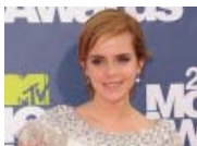
Emma Watson: Guys Are Intimidated By Me,...