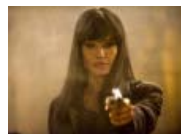
Angelina Jolie's 'Salt' Getting Sequel