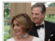
Nancy Pelosi Wears Vintage Thierry Mugler To