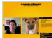
7 Sites You Should Be Wasting Time On Right Now