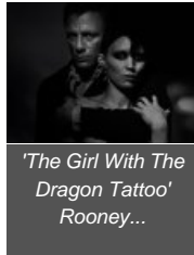
'The Girl With The Dragon Tattoo' Rooney...