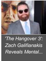
'The Hangover 3': Zach Galifianakis Reveals Mental...