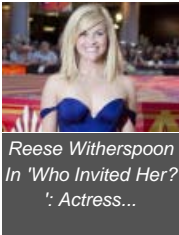
Reese Witherspoon In 'Who Invited Her?': Actress...