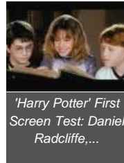
'Harry Potter' First Screen Test: Daniel Radcliffe,...