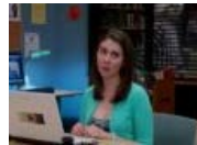
'Community': Beetlejuice Secret Easter Egg In Halloween...