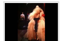
Jean Paul Gaultier: From the Catwalk to the...