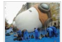
Celebs On Parade