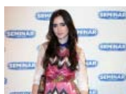
Lily Collins Auditioned For