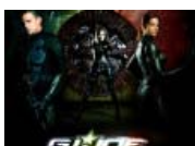
'G.I. Joe' Crew Member Died In