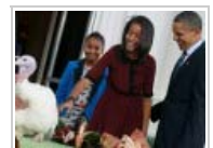
Obama Girls Are Grown Up!