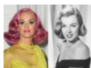
Katy Perry To Star In 'My Week...