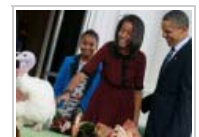
Obama Girls Are Grown Up!