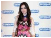
Lily Collins Auditioned For Kristen Stewart's 'Snow...