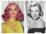
Katy Perry To Star In 'My Week...