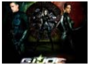
'G.I. Joe' Crew Member Died In On-Set...