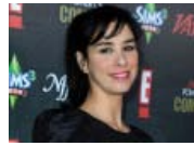
Sarah Silverman Comedy Picked Up By NBC