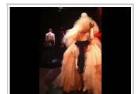
Jean Paul Gaultier: From the Catwalk to the...