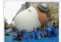
Celebs On Parade