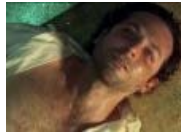
' The Hangover 2 ' Trailers: New TV Spots...