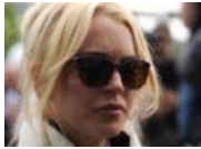
Lindsay Lohan Quickly Released From Jail After...