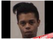
Antoine Dodson Arrested For Marijuana Possession