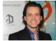
' The Office ' Season Finale: Jim Carrey Joining...