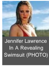
Jennifer Lawrence In A Revealing Swimsuit (PHOTO)