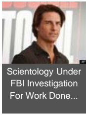
Scientology Under FBI Investigation For Work Done...