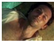
'The Hangover 2' Trailers: New TV Spots...