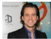
'The Office' Season Finale: Jim Carrey Joining...