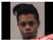
Antoine Dodson Arrested For Marijuana Possession