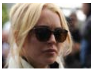
Lindsay Lohan Quickly Released From Jail After...