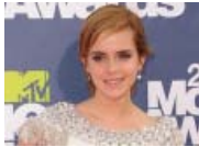
Emma Watson: Guys Are Intimidated By Me,...