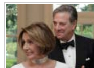
Nancy Pelosi Wears Vintage Thierry Mugler To