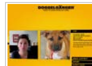
7 Sites You Should Be Wasting Time On Right Now