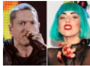
Eminem: 'A Kiss' Calls Lady Gaga 'Male...