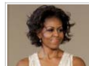
Michelle Obama Wears Naeem Khan To State Dinner