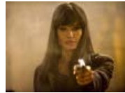
Angelina Jolie's 'Salt' Getting Sequel