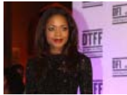
Naomie Harris: New Bond Girl In 'Bond...