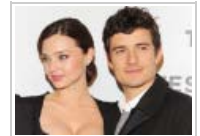
Miranda Kerr & Orlando Bloom Step Out To 'The