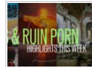
Obama, Hipsters & Ruin Porn: Highlights This