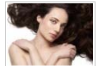
The Experience Of Posing Nude