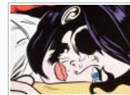
Bombs, Comics And Sartre: Haiku Reviews