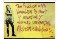
Art Bites: Japan Benefit, Trippy Paintings and