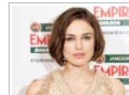
Knightley Gets Dangerous