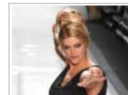
Kirstie Alley Walks NYFW