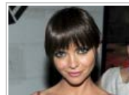
The Alexander Wang Party