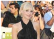
Anna Faris Talks Women Actresses, Co-Stars And...