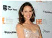
'Butter' Screening: Weinstein Takes On Bachmann, Garner...