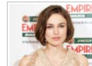
Knightley Gets Dangerous