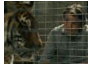
'We Bought A Zoo' Trailer: Matt Damon,...