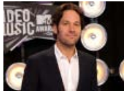
Paul Rudd In Playboy: Self-Loathing, Nudity And...