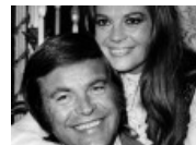
Robert Wagner: Murder Suspect On 'NCIS'