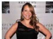
Mariah Carey On HSN: Singer Mocks Viral...