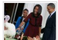
PHOTOS: Sasha And Malia Are All Grown Up!