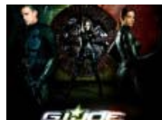
'G.I. Joe' Crew Member Died In On-Set...