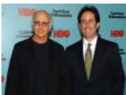
Jerry Seinfeld And Larry David Speculate On...