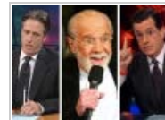
17 Funny Thanksgiving Quotes