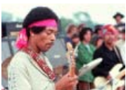
Jimi Hendrix Named Greatest Guitarist Of All...