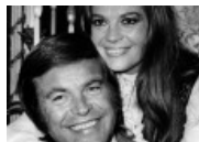
Robert Wagner: Murder Suspect On 'NCIS'