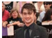
Daniel Radcliffe Almost Wasn't Harry Potter