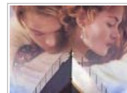
Going Back To 'Titanic'