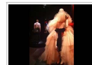
Jean Paul Gaultier: From the Catwalk to the...