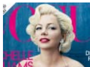
Michelle Williams' Marilyn Monroe Transformation For 'My...