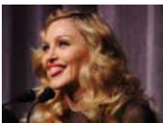
Madonna, In Toronto, Denies Telling Volunteers Not...