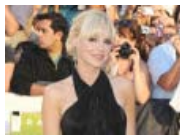
Anna Faris Talks Women Actresses, Co-Stars And...