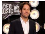
Paul Rudd In Playboy: Self-Loathing, Nudity And...