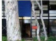
Entire Eames Living Room Inside LACMA for...