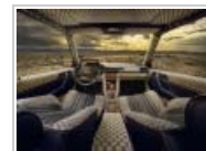
Subculture Of Knockoff