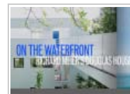
On the Waterfront