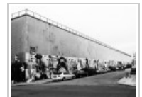
FDNY Street Art