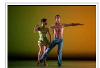
Ballets Russes Updated: Aspen Santa Fe Ballet...