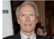
'It's Definitely a Democracy': Clint Eastwood's Self-Portrait...