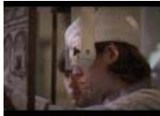
Twin Artists Create '3D Drawing Machine' (VIDEO)