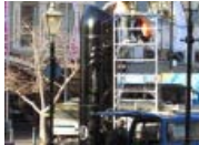
Phallic Sculpture In Dunedin, New Zealand Causes...