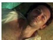
'The Hangover 2' Trailers: New TV Spots...