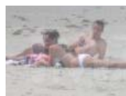
'Teen Mom' Jenelle In A Bikini, Surrounded...