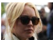
Lindsay Lohan Quickly Released From Jail After...