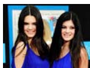
Kendall & Kylie Jenner At 'Prom' Premiere...