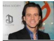
'The Office' Season Finale: Jim Carrey Joining...