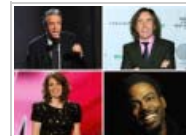
PHOTOS: The Funniest People Not On Twitter