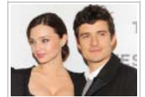
Miranda Kerr & Orlando Bloom Step Out To 'The