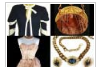
Weekly Roundup of eBay Vintage Clothing Finds