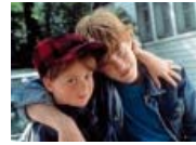
'Pete & Pete' Reunion: Cast, Creative Crew...