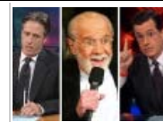
17 Funny Thanksgiving Quotes