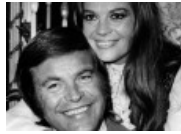
Robert Wagner: Murder Suspect On 'NCIS'