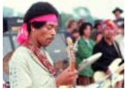
Jimi Hendrix Named Greatest Guitarist Of All...