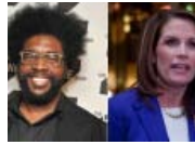
Roots Welcome Bachmann With 'Lyn' As* B*tch'...