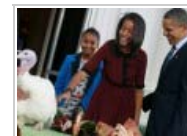
PHOTOS: Sasha And Malia Are All Grown Up!