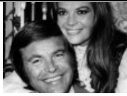
Robert Wagner: Murder Suspect On 'NCIS'