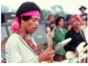
Jimi Hendrix Named Greatest Guitarist Of All...