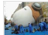
Turkey Day Parade