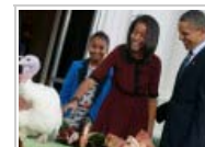
Obama Girls Are Grown Up!