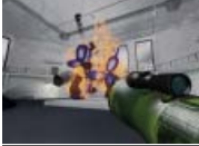
'Jeff Koons Must Die!!!' & 4 Other...