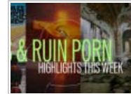
Obama, Hipsters & Ruin Porn: Highlights This