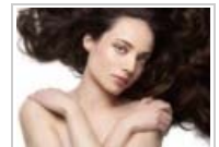
The Experience Of Posing Nude