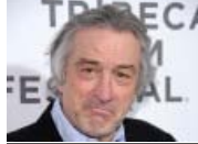
Robert De Niro, Brian Williams Square Off...