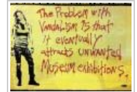
Art Bites: Japan Benefit, Trippy Paintings and