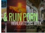
Obama, Hipsters & Ruin Porn: Highlights This...