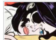
Bombs, Comics And Sartre: Haiku Reviews