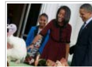
PHOTOS: Sasha And Malia Are All Grown Up!