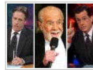
17 Funny Thanksgiving Quotes