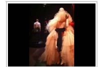
Jean Paul Gaultier: From the Catwalk to the...