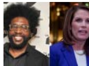
Roots Welcome Bachmann With 'Lyn' As* B*tch'...