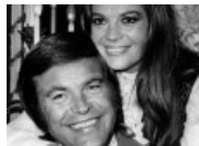
Robert Wagner: Murder Suspect On 'NCIS'