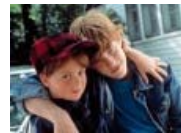
'Pete & Pete' Reunion: Cast, Creative Crew...