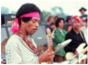
Jimi Hendrix Named Greatest Guitarist Of All...