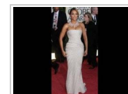
7 Celebrity Fad Diets