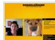
7 Sites You Should Be Wasting Time On Right Now