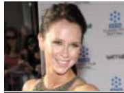
Jennifer Love Hewitt: Worst Actress Since 1985,...