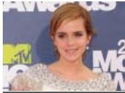
Emma Watson: Guys Are Intimidated By Me,...