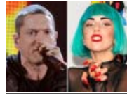
Eminem: 'A Kiss' Calls Lady Gaga 'Male...