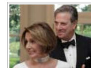
Nancy Pelosi Wears Vintage Thierry Mugler To