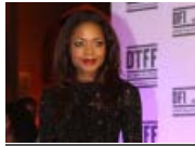
Naomie Harris: New Bond Girl In 'Bond...