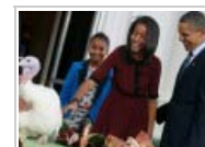
Obama Girls Are Grown Up!