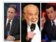
Funny Thanksgiving Quotes