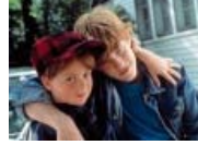
'Pete & Pete' Reunion: Cast, Creative Crew...

FRONT PAGE | POLITICS | BUSINESS | ENTERTAINMENT | TECH | MEDIA | LIFE & STYLE | CULTURE | COMEDY | HEALTHY LIVING | WOMEN | LOCAL | MORE