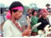
Jimi Hendrix Named Greatest Guitarist Of All...