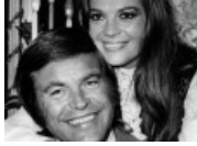
Robert Wagner: Murder Suspect On 'NCIS'