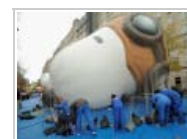
Turkey Day Parade