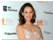
'Butter' Screening: Weinstein Takes On Bachmann, Garner...