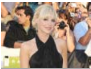
Anna Faris Talks Women Actresses, Co-Stars And...