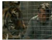
'We Bought A Zoo' Trailer: Matt Damon,...