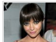
Christina Ricci At Alexander Wang: Hit Or Miss?