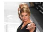
PHOTOS: Kirstie Alley Makes Her Runway Debut