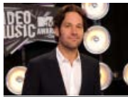
Paul Rudd In Playboy: Self-Loathing, Nudity And...