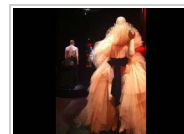
Jean Paul Gaultier: From the Catwalk to the...