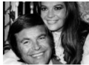
Robert Wagner: Murder Suspect On 'NCIS'