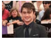
Daniel Radcliffe Almost Wasn't Harry Potter