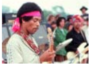
Jimi Hendrix Named Greatest Guitarist Of All...