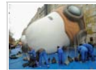
Celebs On Parade