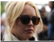
Lindsay Lohan Quickly Released From Jail After...