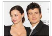
Miranda Kerr & Orlando Bloom Step Out To 'The