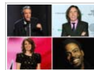
PHOTOS: The Funniest People Not On Twitter