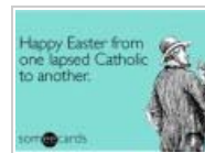
The Funniest Someecards For Easter 2011