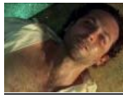
'The Hangover 2' Trailers: New TV Spots...