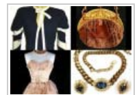
Weekly Roundup of eBay Vintage Clothing Finds