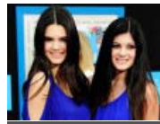
Kendall & Kylie Jenner At 'Prom' Premiere...