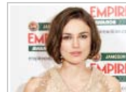
Knightley Gets Dangerous