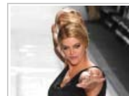
Kirstie Alley Walks NYFW