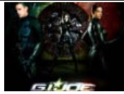
'G.I. Joe' Crew Member Died In On-Set...