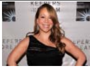
Mariah Carey On HSN: Singer Mocks Viral...