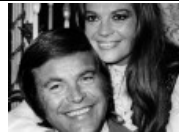
Robert Wagner: Murder Suspect On 'NCIS'

FRONT PAGE | POLITICS | BUSINESS | ENTERTAINMENT | TECH | MEDIA | LIFE & STYLE | CULTURE | COMEDY | HEALTHY LIVING | WOMEN | LOCAL | MORE