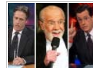
Funny Thanksgiving Quotes