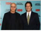
Jerry Seinfeld And Larry David Speculate On...