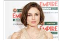
Knightley Gets Dangerous