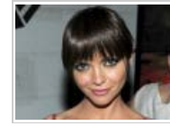
The Alexander Wang Party