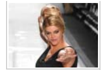
Kirstie Alley Walks NYFW