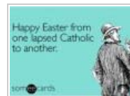
The Funniest Someecards For Easter 2011