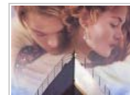
Going Back To 'Titanic'