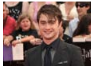
Daniel Radcliffe Almost Wasn't Harry Potter