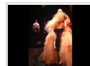
Jean Paul Gaultier: From the Catwalk to the...