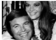
Robert Wagner: Murder Suspect On 'NCIS'