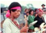
Jimi Hendrix Named Greatest Guitarist Of All...