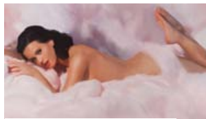
Album review: Katy Perry's 'Teenage Dream'