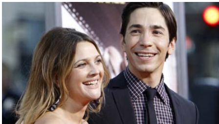
'Going the Distance' premiere