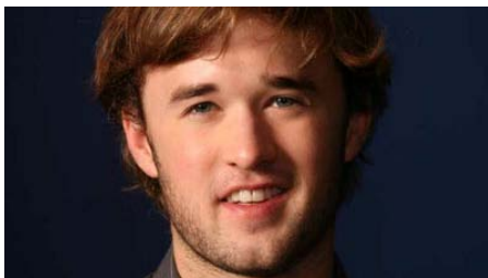
The child stars of Gen X and Y: Where are they now? More...