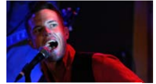
Live review: Brandon Flowers at the Troubadour