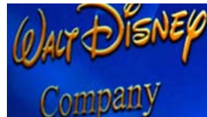
Man accused in Disney insider trading scheme pleads guilty