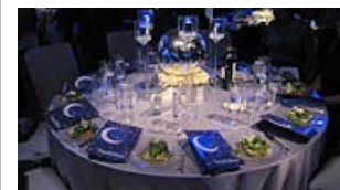
The Envelope Inside peek: Emmys Governors Ball