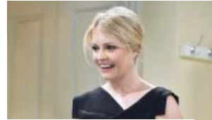
Television review: 'Big Lake,' 'Melissa & Joey' tackle family humor in distinct ways