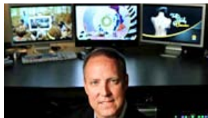
Ovation's growth may be worthy of applause More...