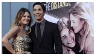
'Going the Distance': On the red carpet with Drew Barrymore and Justin Long