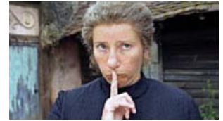
Movie review: 'Nanny McPhee Returns'