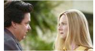
Television review: 'The Big C'