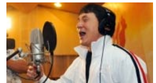
If Jackie Chan says it's good — well, get a second opinion