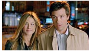
Movie review: 'The Switch'