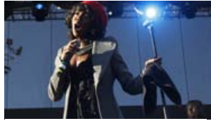
Live review: Rock the Bells still tolls for 1993 More...