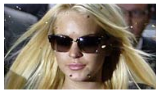
Lindsay Lohan leaves rehab after 23 days