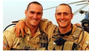
Movie review: 'The Tillman Story' hits with force