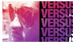
Album review: Usher's 'Versus'