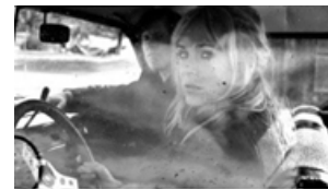
Album review: Isobel Campbell & Mark Lanegan's 'Hawk'