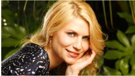
Photos: Celebrities by The Times in 2010