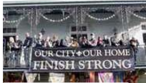
Television review: 'If God Is Willing and Da Creek Don't Rise' on HBO More...