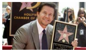
Test drive The Times' Hollywood Walk of Fame iPhone app