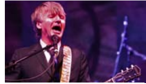
Live review: Crowded House at Club Nokia