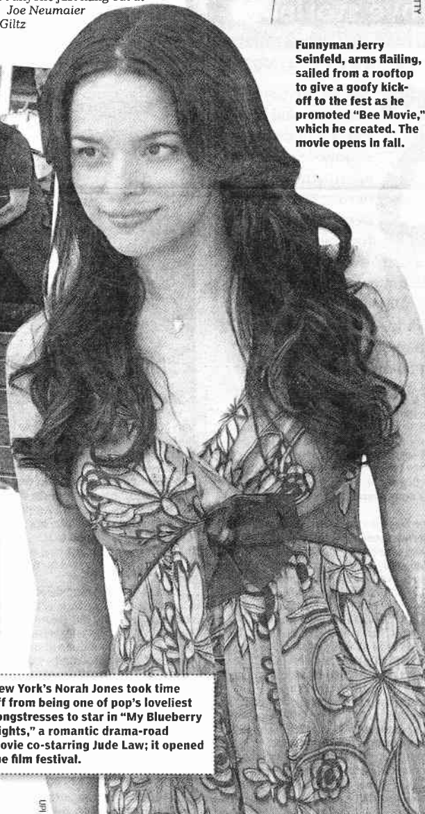
New York's Norah Jones took time off from being one of pop's loveliest songstresses to star in "My Blueberry Nights," a romantic drama-road movie co-starring Jude Law; it opened the film festival.