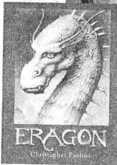
FIRESTARTER Christopher Paolini, born in California and raised in Montana, wrote "Eragon" when he was 17. The new movie (top) is a hit.

when characters would do a line of dialogue right out of the book and it was a déjà vu, and it was a 'Twilight Zone'-sort of moment."