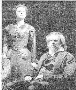
Hawke in "The Coast of Utopia" at Lincoln Center (l.) and with Julie Delpy in 1995's "Before Sunrise."

Always passionate and opinionated, Hawke is definitely less fiery and pointed than he was as a younger man, as he himself would be the first to say. So, when adapting a book he wrote more than a decade ago, Hawke found himself identifying less with William, the besotted young hero, and more