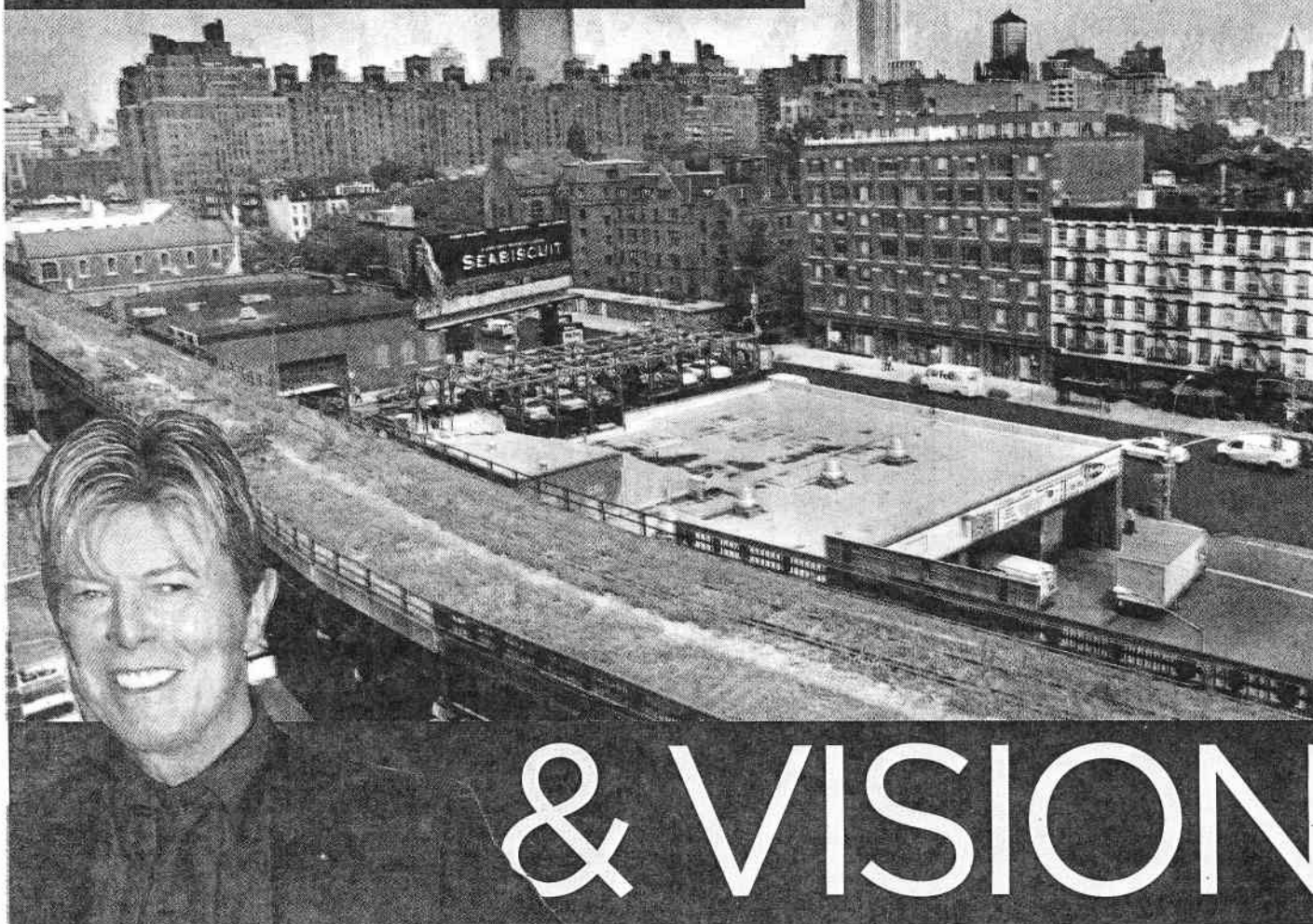
David Bowie (below l.) is curator of the High Line Festival, named for elevated West Side tracks.