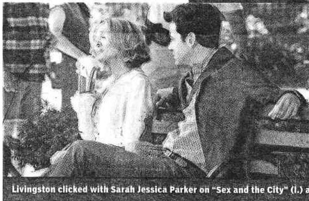
Livingston clicked with Sarah Jessica Parker on "Sex and the City" (l.) and with Jennifer Aniston in the film "Office Space."