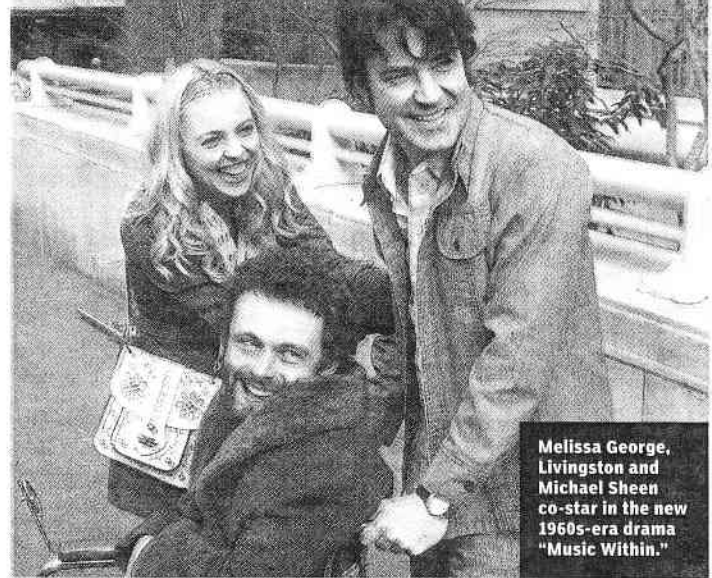
Melissa George, Livingston and Michael Sheen co-star in the new 1960s-era drama "Music Within."

Trading on an everyman appeal, to great effect.