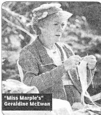
"Miss Marple's" Geraldine McEwan

■ "Burn Notice" "Retired" spy Michael (Jeffrey Donovan) rescues a friend's daughter from prostitution while trying to avoid being retired for good by an assassin. (USA, 10 p.m.)