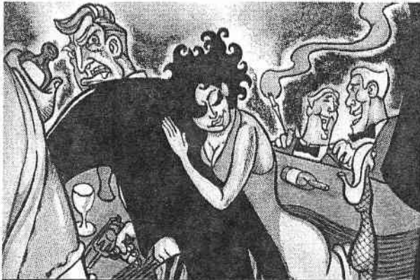
Artwork for Off-Broadway musical "The Wild Party" at Gallery Players. Illustration by Mike Malbrough

the talent they might not otherwise see because we're out of the way. There's tons of talent that goes unnoticed."