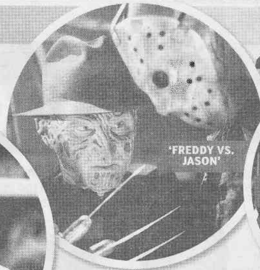
'FREDDY VS. JASON'

The verdict: The only person fooled was actor Diego Luna, who made this turkey his high-profile followup to the critical smash "Y Tu